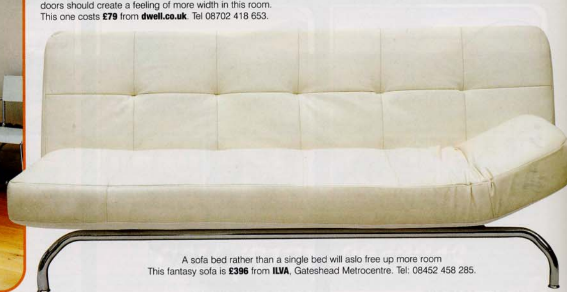
A sofa bed rather than a single bed will also free up more room. This fantasy sofa is £396 from ILVA , Gateshead Metrocentre. Tel: 08452 458 285.

Placing a full-length mirror on one or more of the wardrobe doors should create a feeling of more width in this room. This one costs £79 from dwell.co.uk . Tel 08702 418 653.