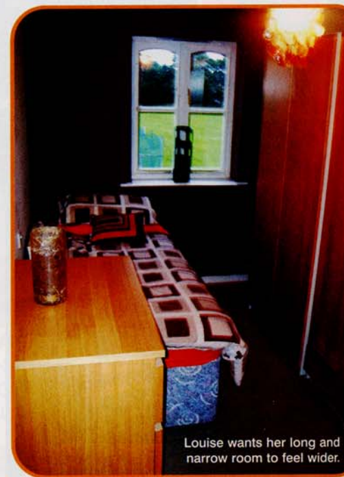
Louise wants her long and narrow room to feel wider.

colour, it's just too dark for a room of this size. Brightening up with lighter colours gives a more spacious feel any room. Pick just a few light and natural hues and apply them throughout this room, including accessories, fittings and furniture, removing any cluttered or busy feel.