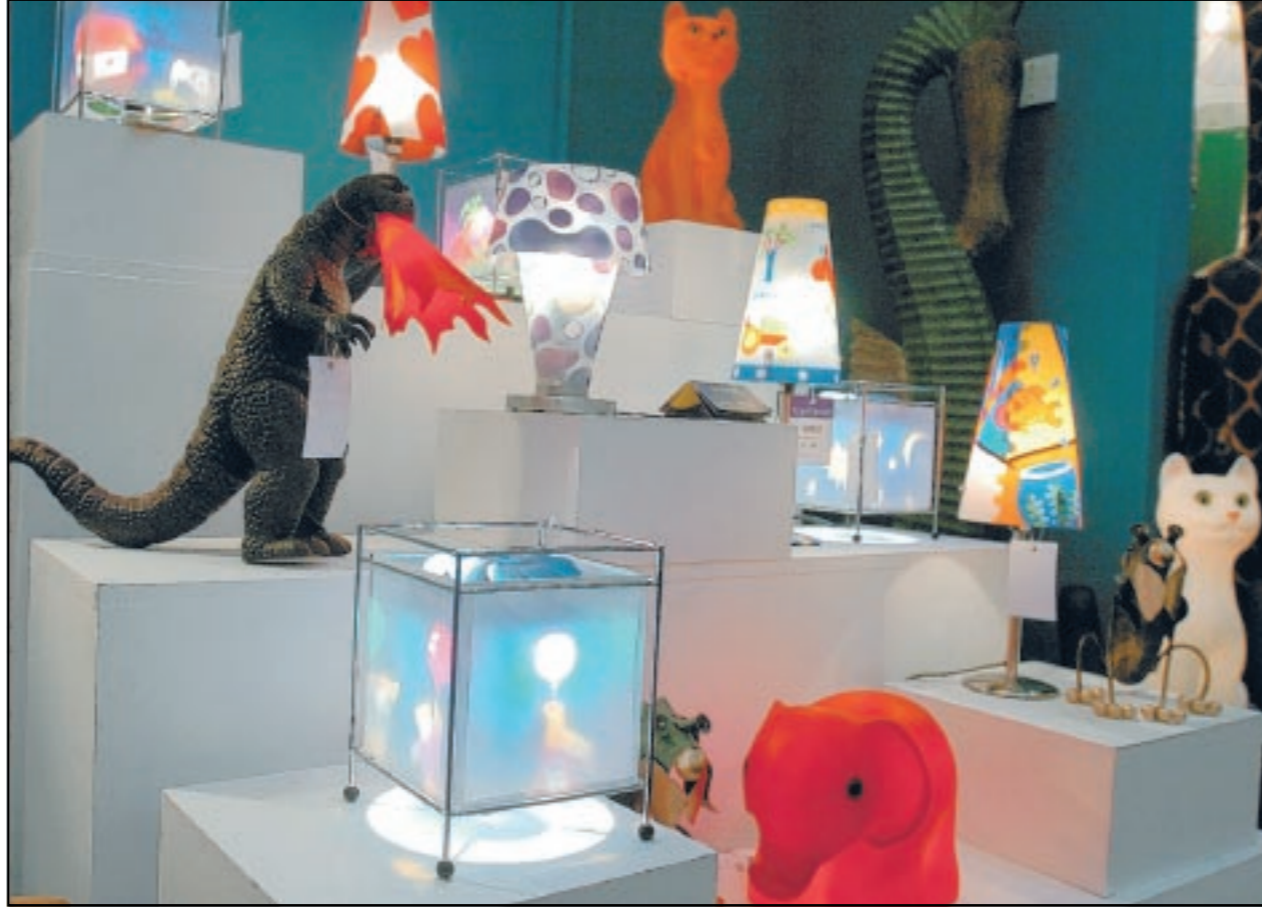
Lamps galore: Cotterell Light Centres has a superb collection of lamps designed specially for children.

● Cotterell Light Centres, North Tyne Industrial Estate, Benton, Tyne & Wear, tel: (0191) 266-8883 or visit the website at www.cotterell-lightcentres.com .