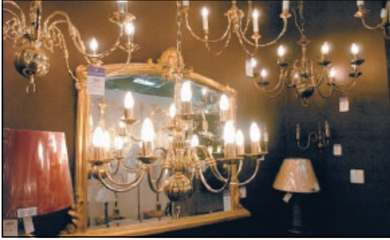
Sparkling choice: Choose an exquisite chandelier for a real touch of glamour.