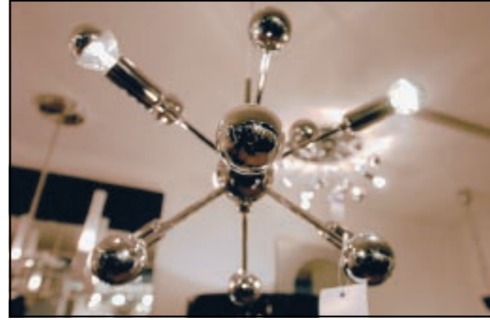
Space age: Lighting fit for the space age.