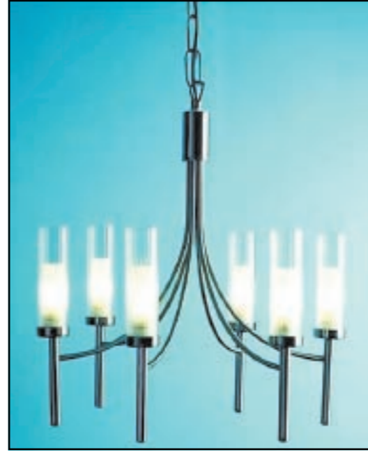
Modern twist: The Reed pendant – a modern take on the traditional chandelier.